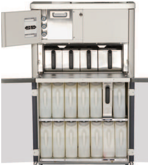
Reagent cabinet including external drain and fill ports

Together with a colour touch screen, safety features such as a bottle connection check and an illuminated Reagent Cabinet (for visual check of reagents), the VIP® 6 offers you the best in conventional overnight tissue processing.